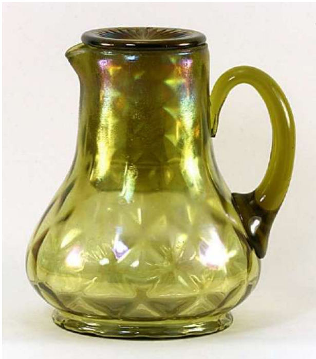
Northwood #559 Guest Set, Russet