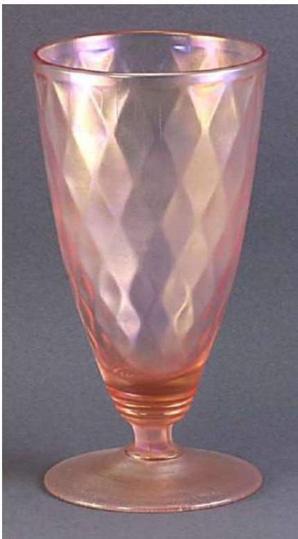
Fenton #1502, goblet, Velva Rose