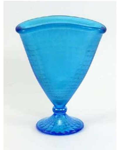
Fenton #53 cologne base made into fan vase, Celeste Blue