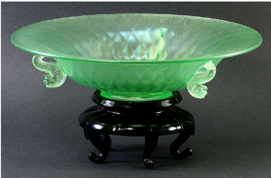
Fenton #1502, triple-dolphin bowl, Florentine Green