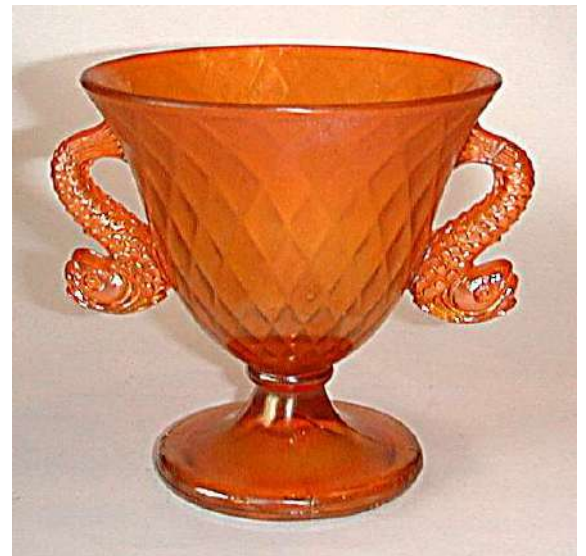
Fenton #1502, double-dolphin comport, Tangerine