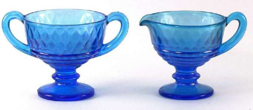
Fenton #1502, creamer & sugar, Celeste Blue