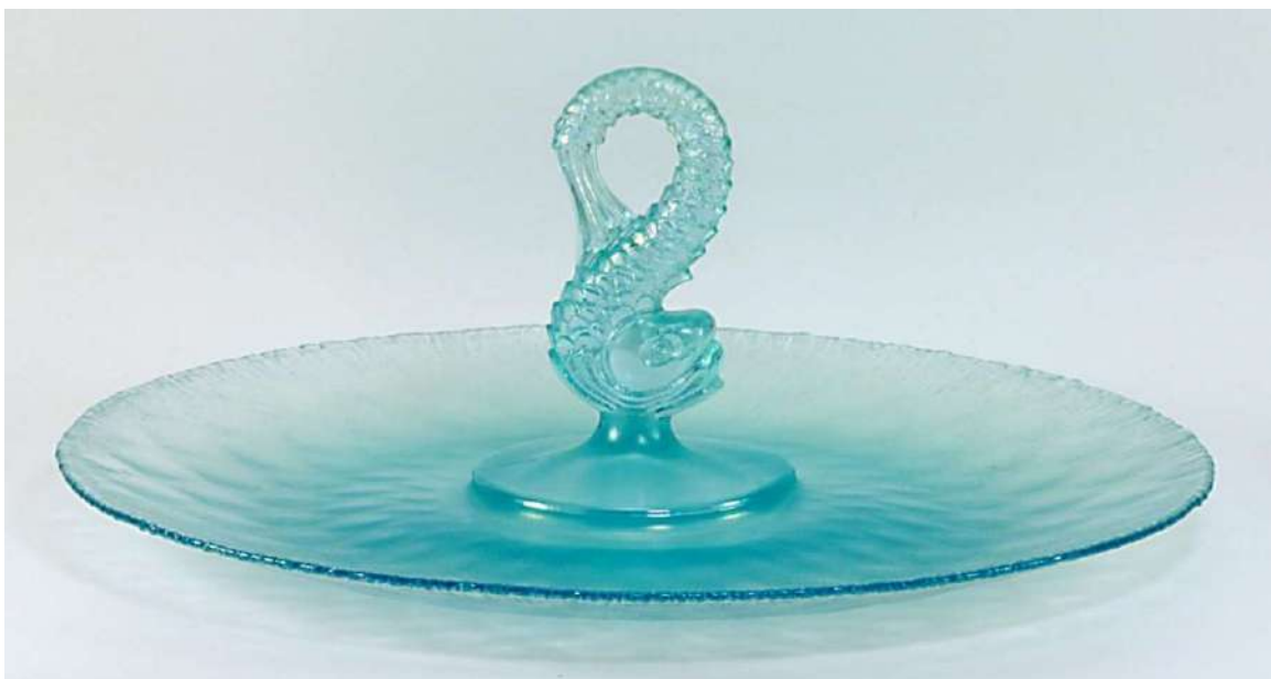
Fenton #1502, dolphin-handled server, Aquamarine