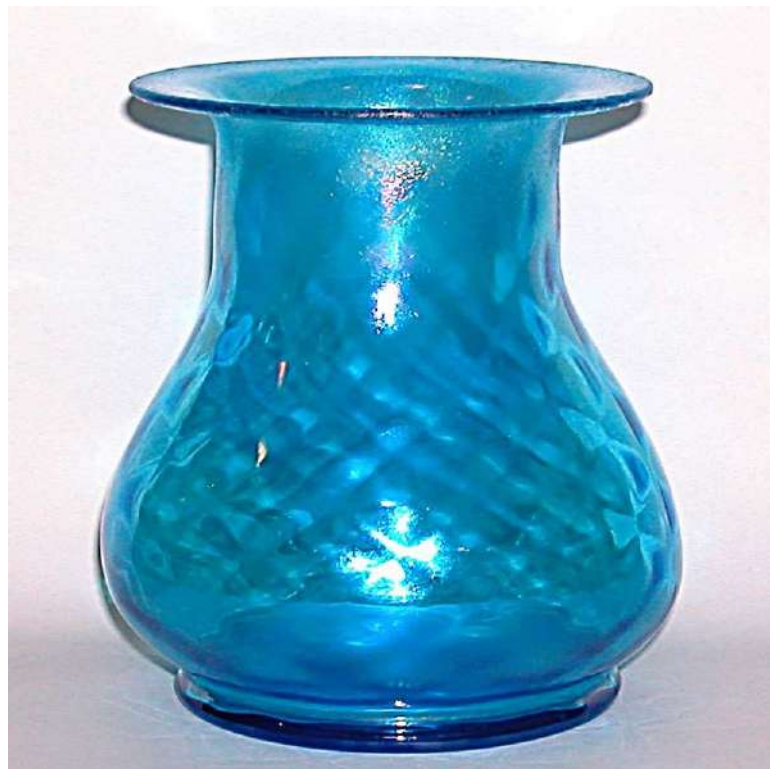
Northwood vase, unusual flared-round top, Blue