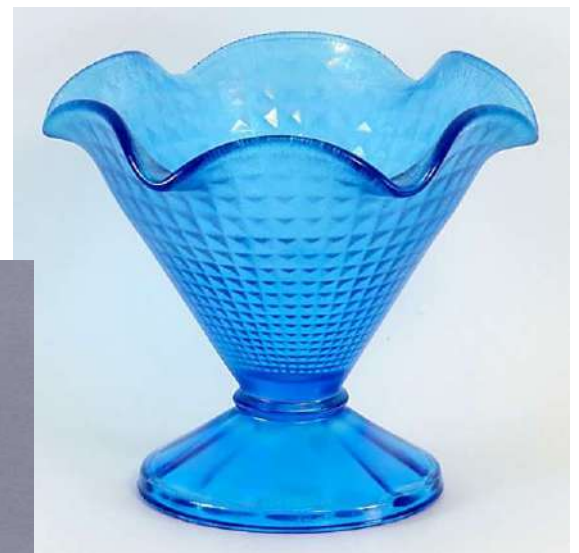
Fenton vase, 6-crimp top, Celeste Blue