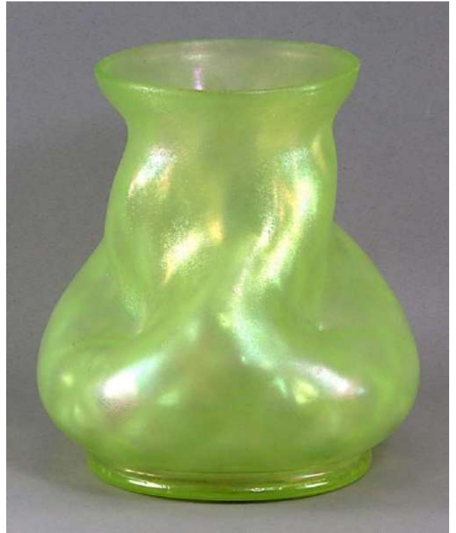
Northwood vase, round top, twist-pinch sides, Topaz