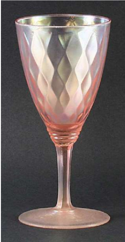
Fenton #1502, stemmed goblet, Velva Rose