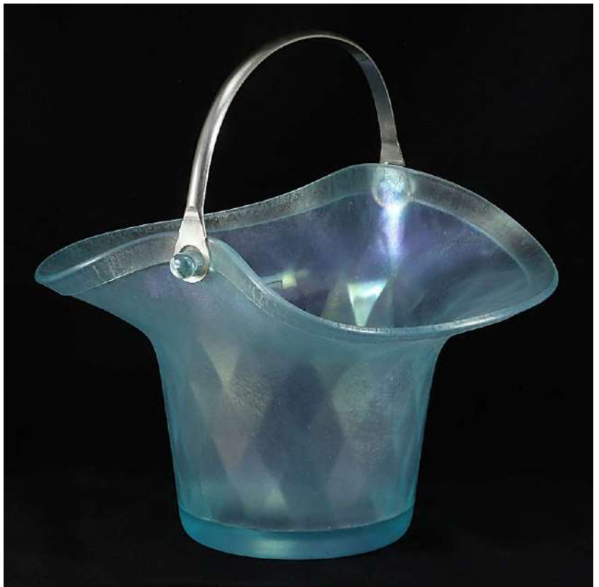
Fenton #1616, basket, stuck base, Aquamarine