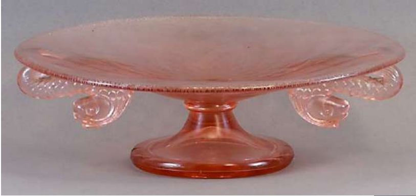
Fenton #1502, twin-dolphin card tray, Vella Rose (side and top view)