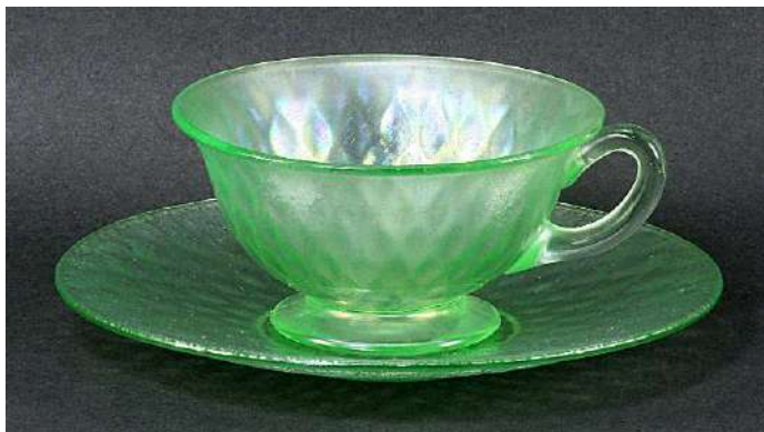
Fenton #1502, cup & saucer, Florentine Green