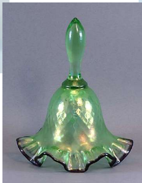
Fenton bell, double-crimp edge, Apple Green with Purple Crest