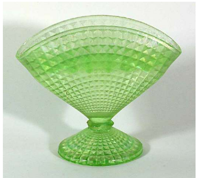
Fenton #567 vase (made with #568 candy jar base), Florentine Green