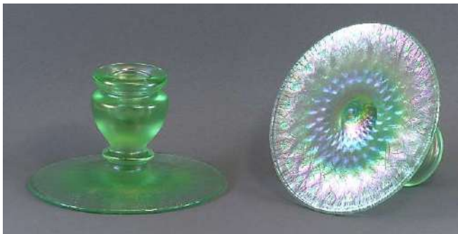
Fenton #1502 (#318), candleholders, Florentine Green