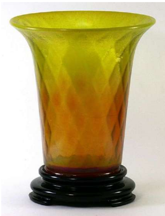
Fenton #1502, 8-inch vase, Tangerine

Fenton’s #1502 line is identified as “diamond optic” in their catalogs.