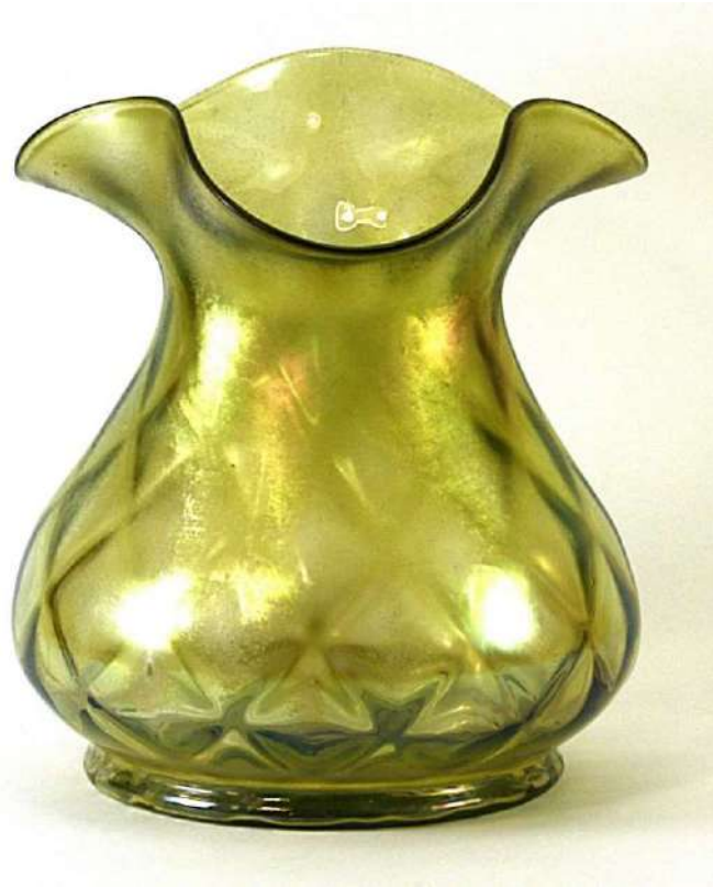
Northwood vase, 3-crimp top, Russet