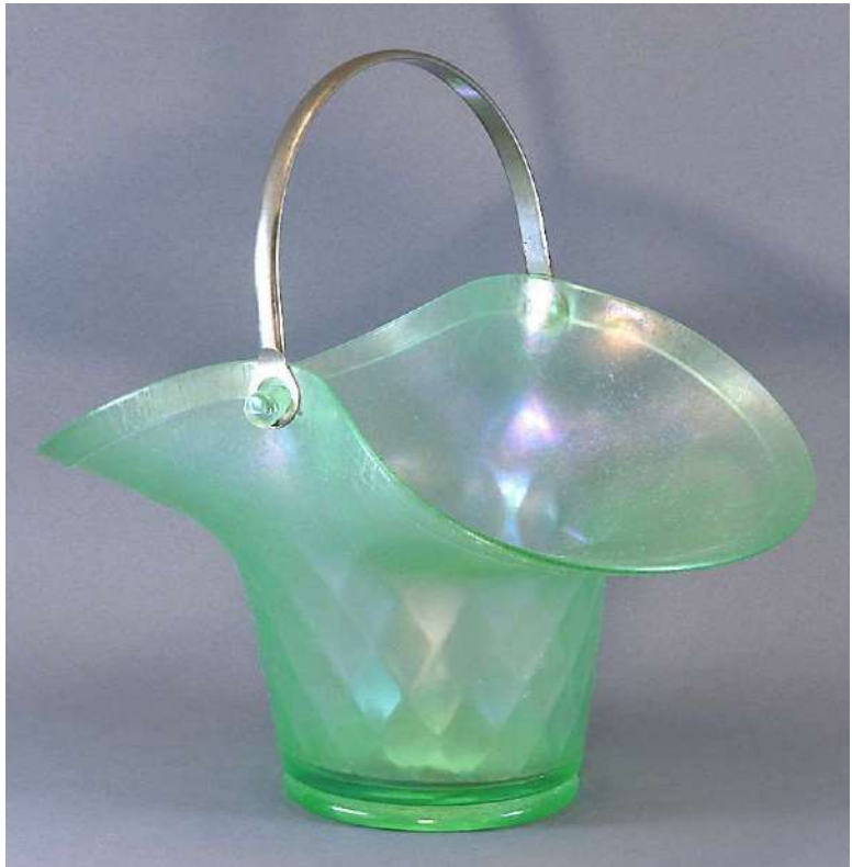
Fenton #1616, basket, snap base, Florentine Green