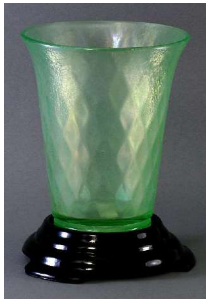
Fenton #1502, 6-inch vase, Florentine Green