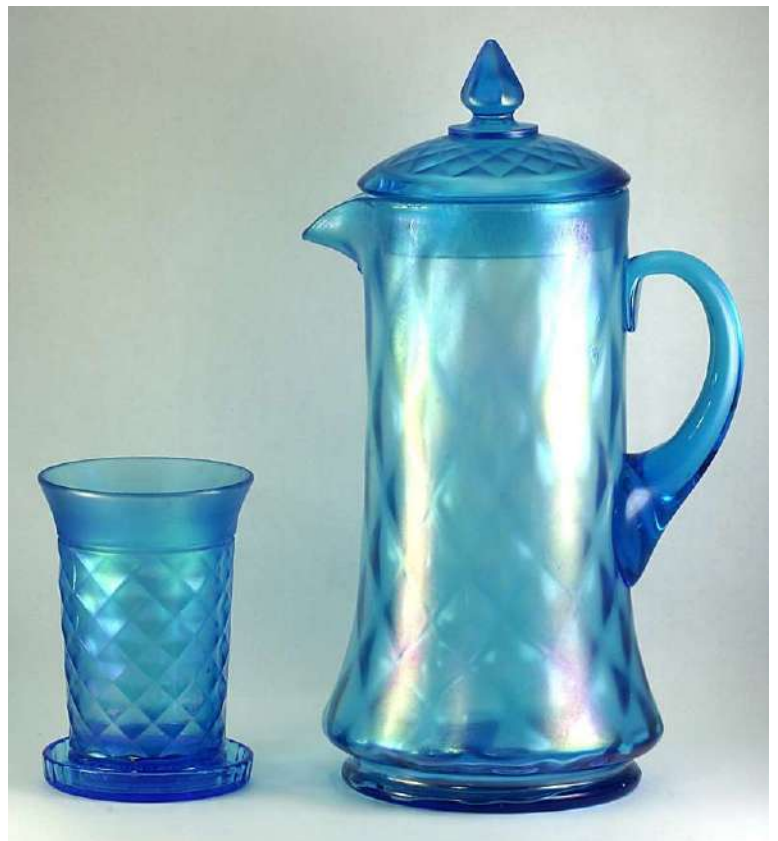
Northwood tall pitcher with lid and tumbler, Blue