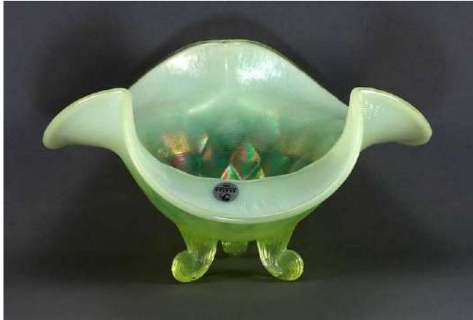
Fenton bowl, SGS 2003 three-sides up, Topaz Opalescent