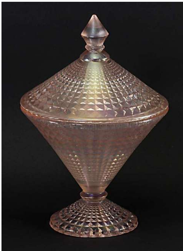
Fenton #568 candy jar, Velva Rose