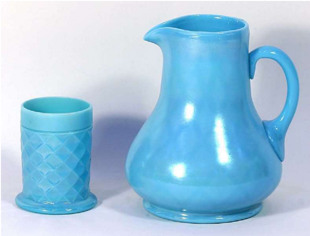
Northwood #559 Guest Set, Jade Blue (Notice that jug has diamond optic pattern, but tumbler has external diamond pattern!)