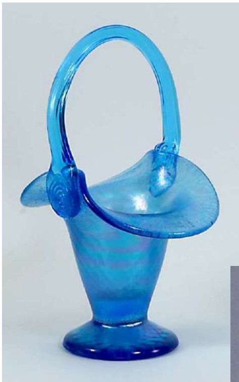
Fenton #4755 basket, Celeste Blue