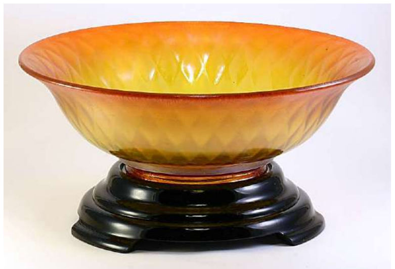
Fenton #1502, 8-inch bowl (= #600), Tangerine