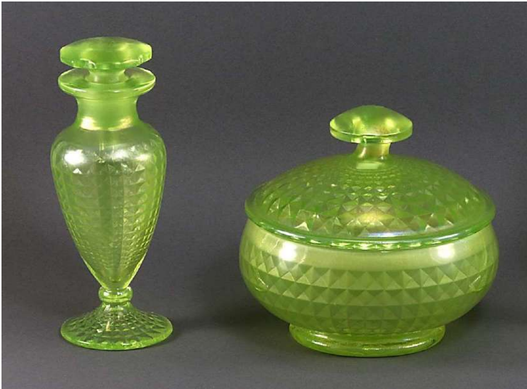
Fenton #53 cologne & puff box, Topaz

Notice that “diamonds” are actually tiny pyramids (square sides with four triangles)!