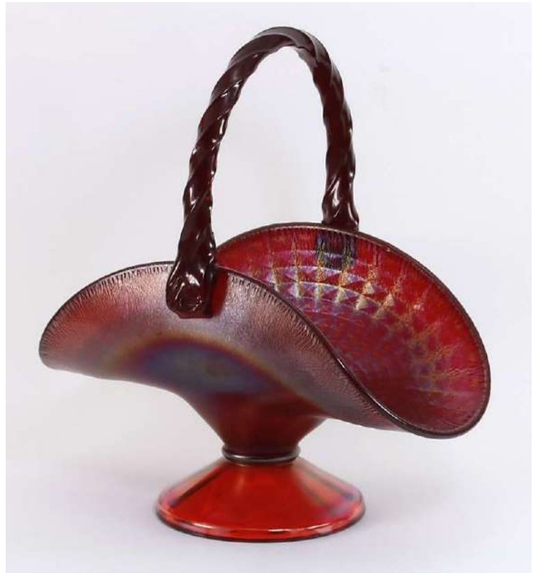
Fenton sample basket, oval, Ruby Stretch