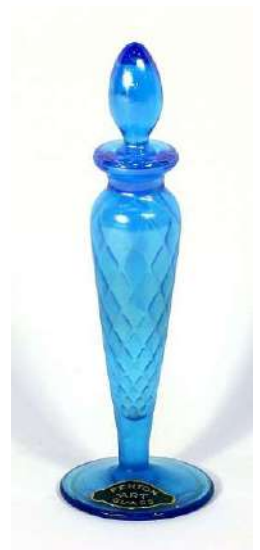
Fenton #1502, cologne, Celeste Blue